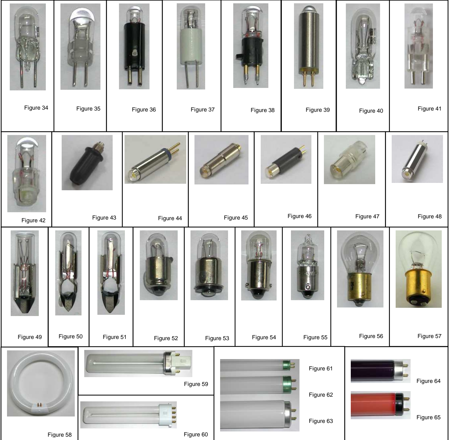
Figure Numbers Correspond To The Cross Reference Guide And Price Sheet For Dental Equipment July, 2014 No Part Of This Catalog/Price Sheet May Be Reproduced Without Permission Dental Equipment & Supply. CALL: 800-365-6265 (319-362-2265) • FAX: 319-362-1184 E-mail: sales@dentalequipmentandsupply.com Online: www.dentalequipmentandsupply.com